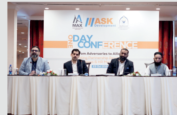
Session 1: The role of managers in the achievement of organizational objectives.

This Conference was held on October 23, 2024, at Avari Hotel, Lahore.