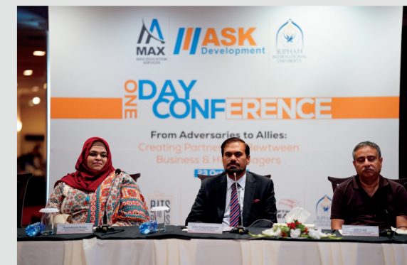
Session 4: The role of technology in managing employee engagement. How line and HR managers can collaborate for productivity.